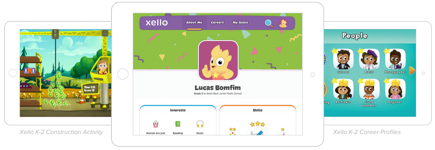
Xello 3-5 Student Profile

Xello is an engaging online program that helps students in K-12 build the knowledge, skills, and plans for future success. Through self-knowledge, exploration and planning students better understand who they are, their academic and career options, and the steps they'll need to take to achieve their goals.