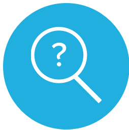
Investigation and Inquiry

This activity package builds on the activities in the Xello for Kindergarten to 2nd Grade Supplementary In-Class Activities Guide. It includes activities for each of four key areas: