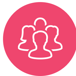
Me and My Community